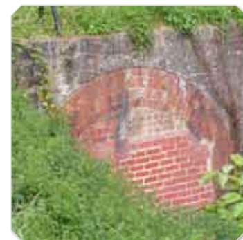
Norwood - The blocked eastern portal.

Funded by Yorkshire Forward this major study will finalise the route and develop plans for the link between the Canal in Derbyshire and the rest of the national system.